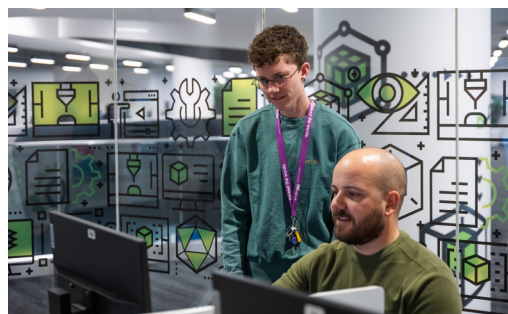
Blind Enthusiasm Group Computer Lab

Want to see the space in person or have additional questions? Email us at MilnerRoomBookings@epl.ca or call 780-496-7000 for more information.